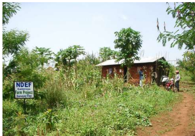
The entrance to Okomanjang Farm

Following the acquisition of land in Okomanjang village, Menchum Division in 2005, NDEF in-