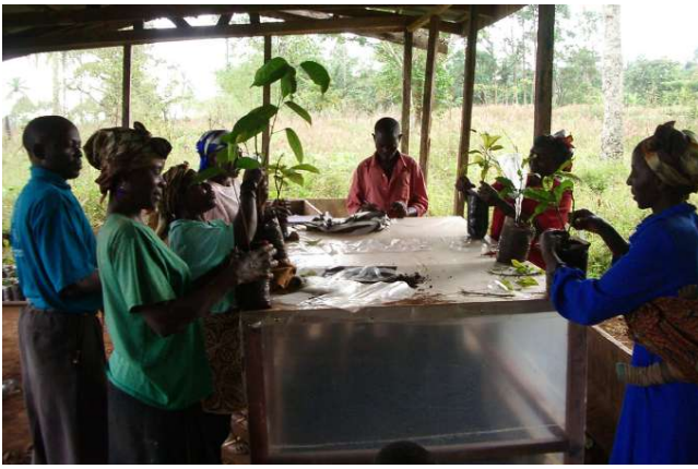
Farmers practise the technique of grafting

nating tree domestication techniques to rural communities and farmers' groups.