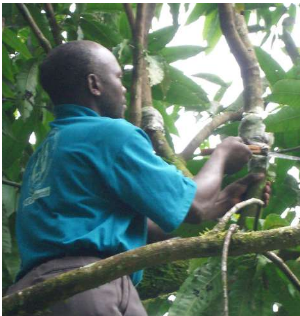
NDEF Staff harvesting marcots

In Menchum Division, two farmers' groups were trained in marcotting techniques, and NDEF has high hopes for a group of young farmers in Okomanjang Village, who have just joined the tree domestication train enthusiastically.