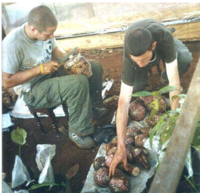
Volunteers at NDEF prepare plantain suckers for multiplication

In the future, NDEF hopes to extend its newly-acquired knowledge in this domain to the farmers' groups with which it works. The benefits should be significant—not only does rapid multiplication allow high yielding plantains to be planted in order to raise the income they can provide, but the technique also ensures suckers are pest and disease free.