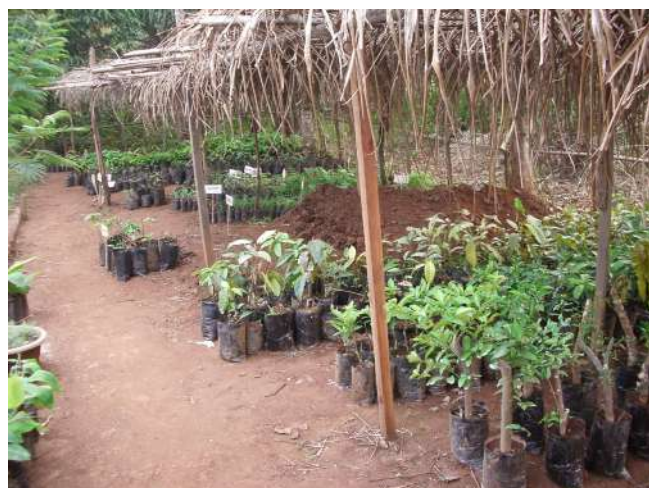
A section of NDEF's Bamenda nursery